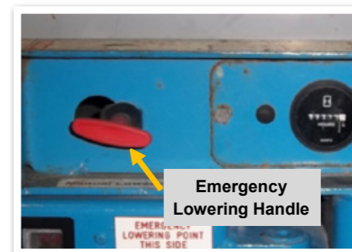
Emergency Lowering Handle for Gen 3 & 4