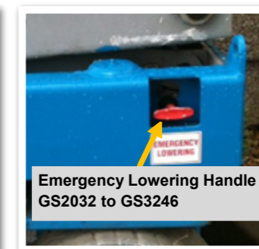
Emergency Lowering Handle for Gen 5