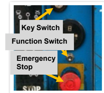
Lower Controls for Gen 5